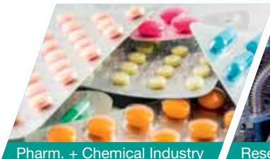
Pharm. + Chemical Industry